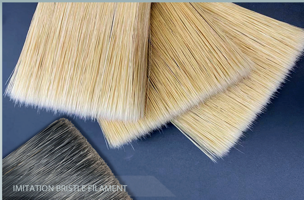
IMITATION BRISTLE FILAMENT