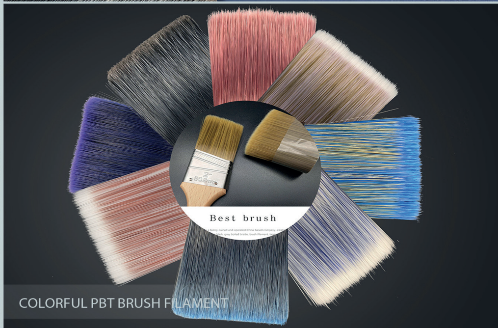
COLORFUL PBT BRUSH FILAMENT