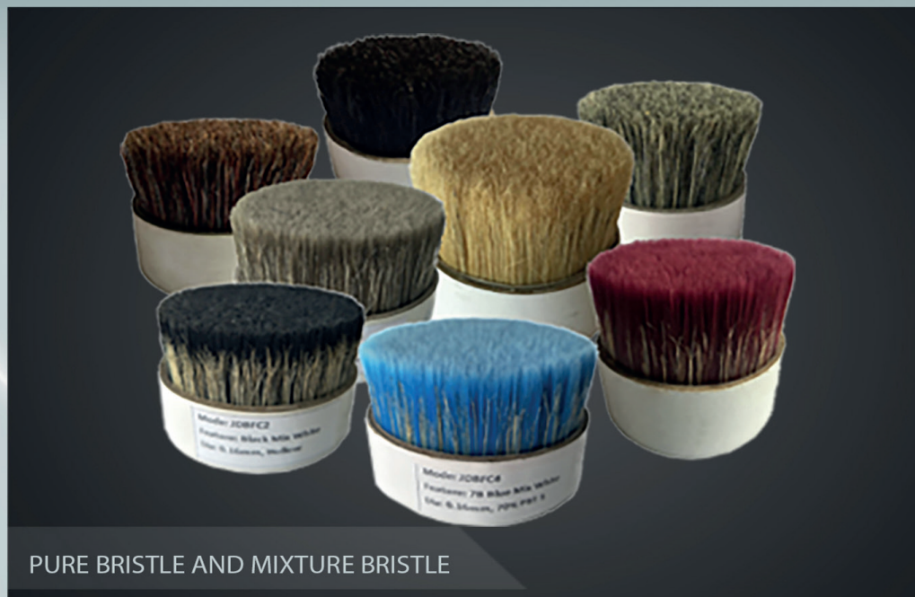
PURE BRISTLE AND MIXTURE BRISTLE